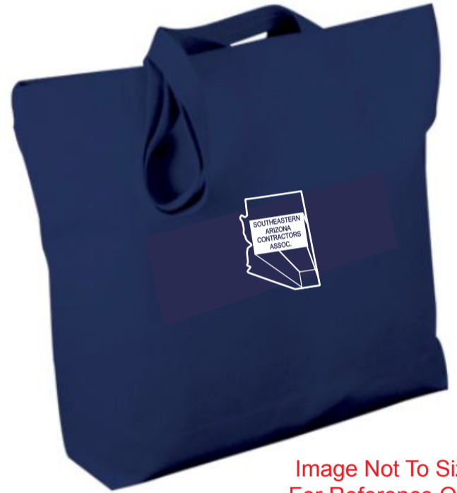
Image Not To Size For Reference Only