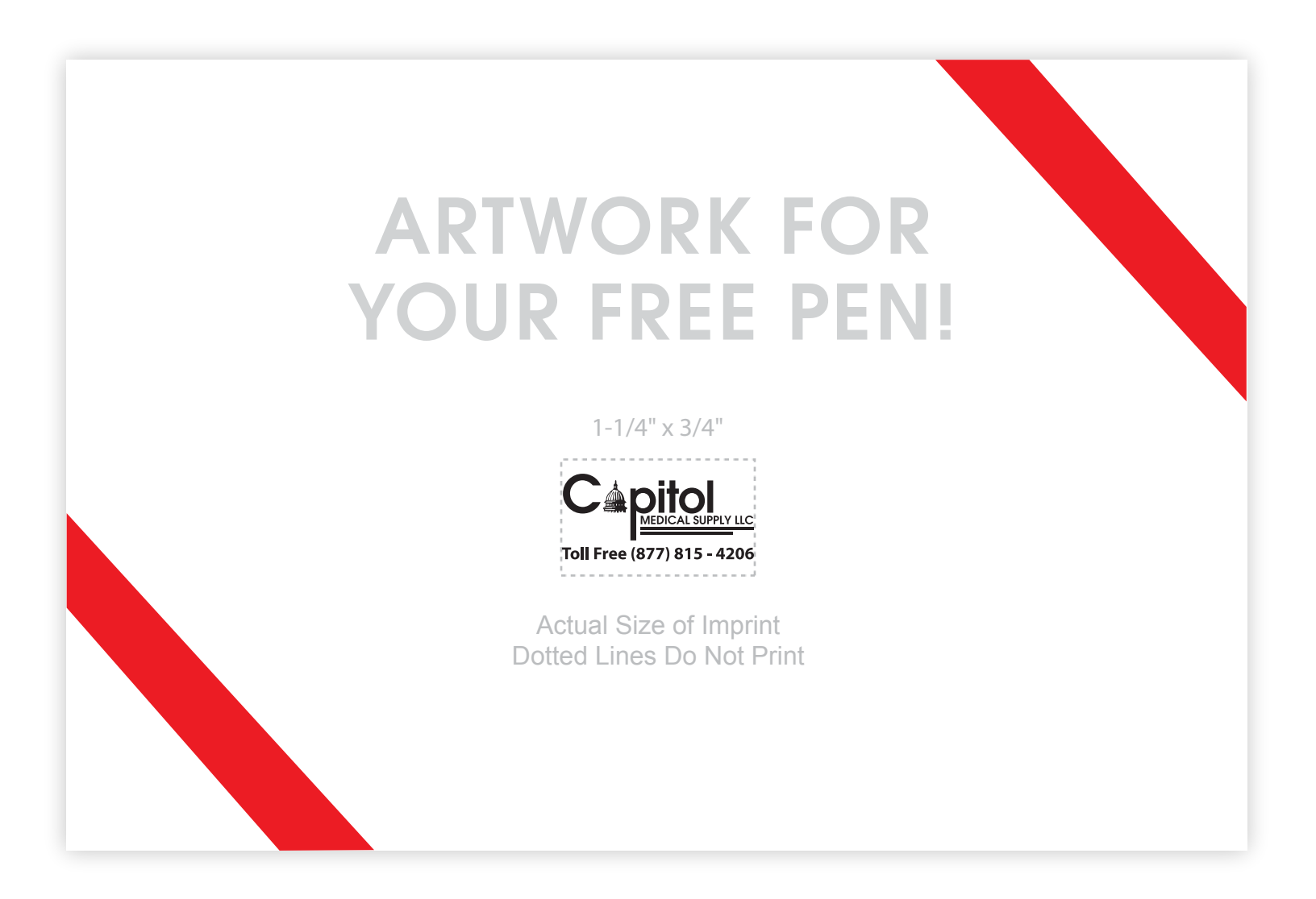
IMAGE IS FOR REFERENCE ONLY. COLORS, SIZE, AND APPEARANCE MAY DIFFER ON ACTUAL PRODUCT.

250 Pens with your logo FREE with any order $500 or more (BEFORE SHIPPING). Black imprint only. Our art dept will place your logo and/or one line of text to best fit the imprint area. Pens and pen color will be picked at random. Includes standard production and ground shipping within the continental US only. Other restrictions may apply. Limited time only.