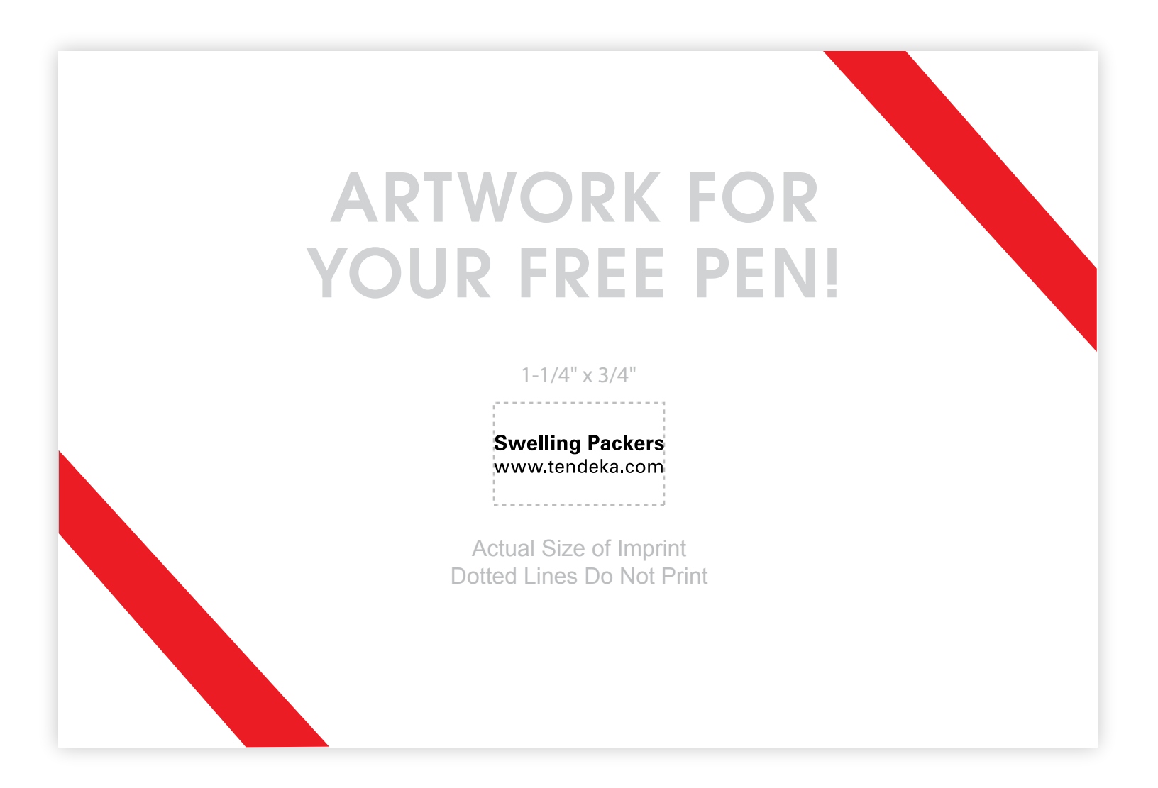
IMAGE IS FOR REFERENCE ONLY. COLORS, SIZE, AND APPEARANCE MAY DIFFER ON ACTUAL PRODUCT.

250 Pens with your logo FREE with any order $500 or more (BEFORE SHIPPING). Black imprint only. Our art dept will place your logo and/or one line of text to best fit the imprint area. Pens and pen color will be picked at random. Includes standard production and ground shipping within the continental US only. Other restrictions may apply. Limited time only.