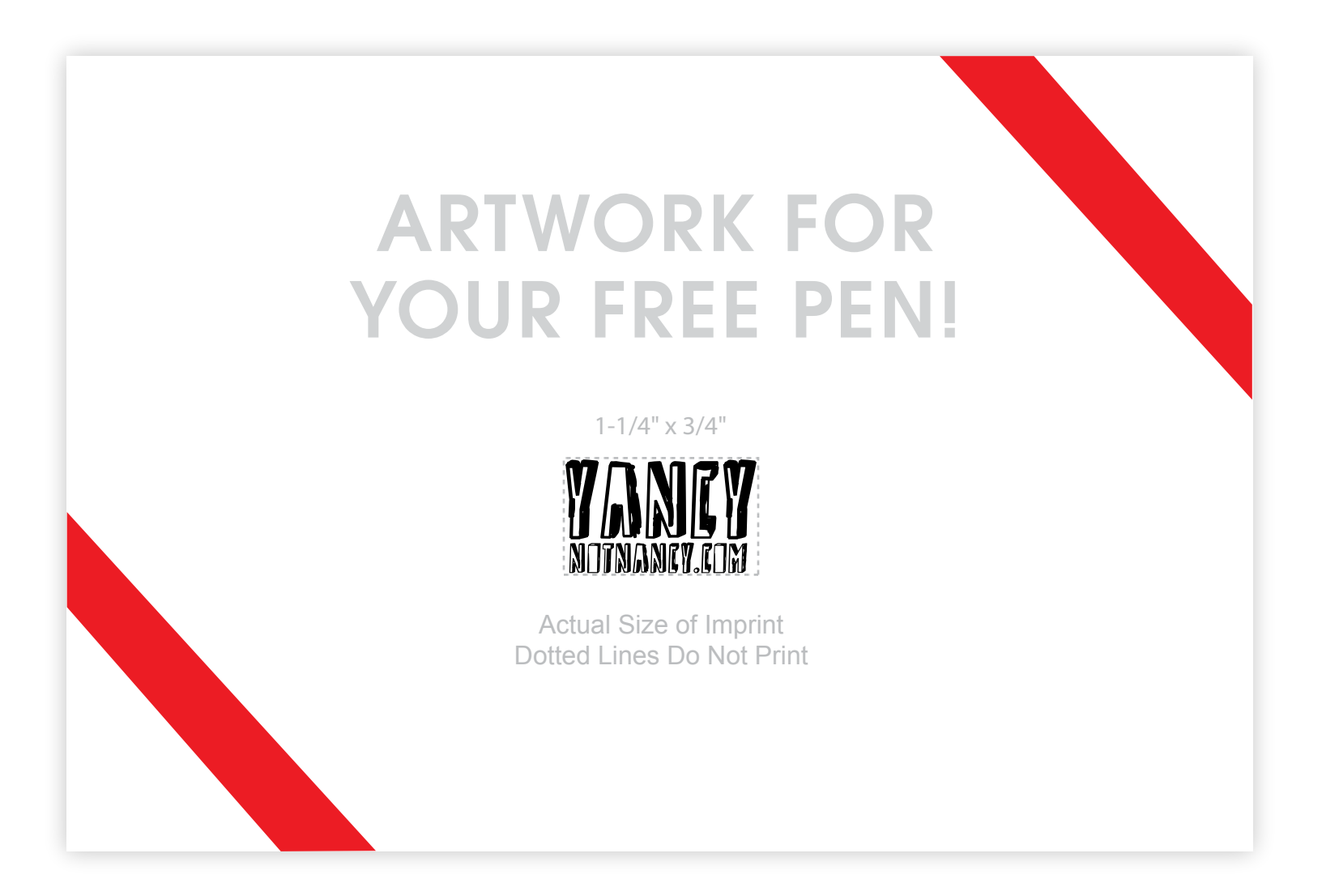
IMAGE IS FOR REFERENCE ONLY. COLORS, SIZE, AND APPEARANCE MAY DIFFER ON ACTUAL PRODUCT.

250 Pens with your logo FREE with any order $500 or more (BEFORE SHIPPING). Black imprint only. Our art dept will place your logo and/or one line of text to best fit the imprint area. Pens and pen color will be picked at random. Includes standard production and ground shipping within the continental US only. Other restrictions may apply. Limited time only.