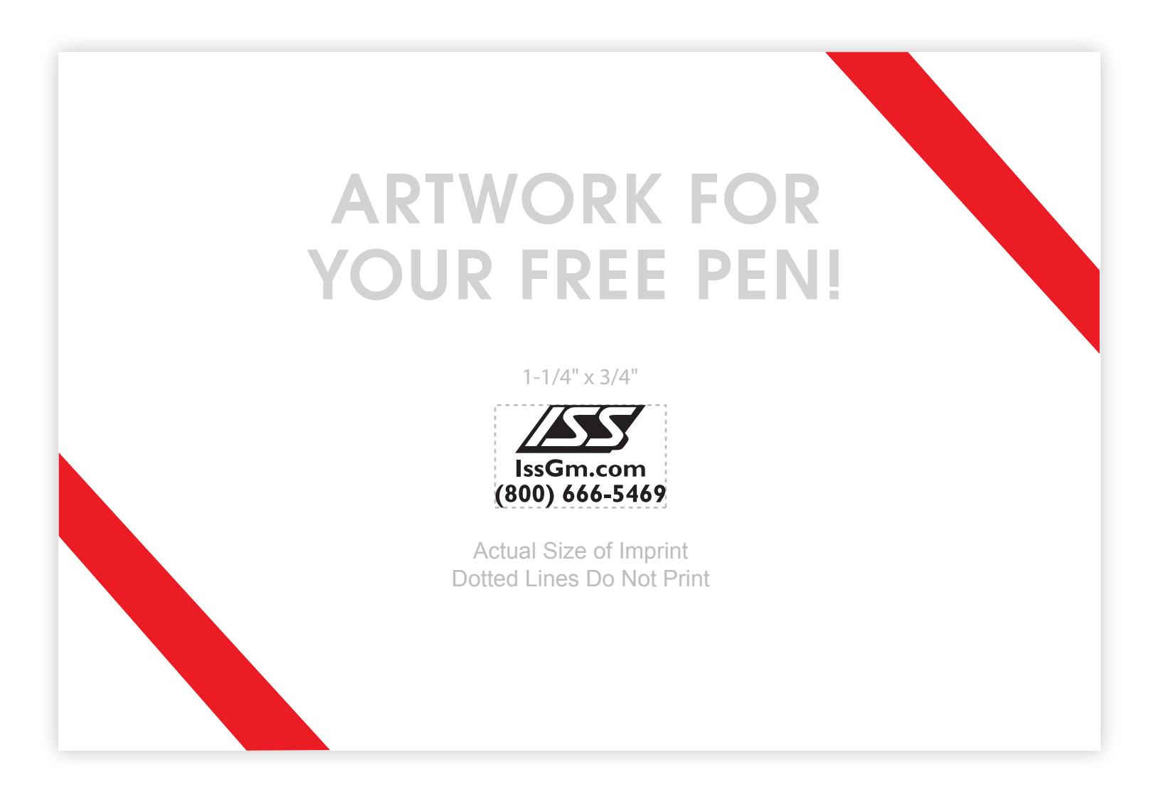
IMAGE IS FOR REFERENCE ONLY. COLORS, SIZE, AND APPEARANCE MAY DIFFER ON ACTUAL PRODUCT.

250 Pens with your logo FREE with any order $500 or more (BEFORE SHIPPING). Black imprint only. Our art dept will place your logo and/or one line of text to best fit the imprint area. Pens and pen color will be picked at random. Includes standard production and ground shipping within the continental US only. Other restrictions may apply. Limited time only.