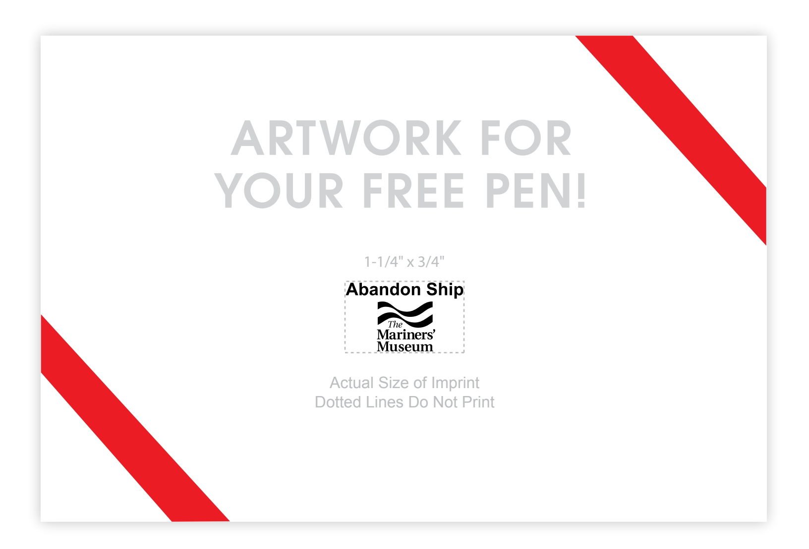
IMAGE IS FOR REFERENCE ONLY. COLORS, SIZE, AND APPEARANCE MAY DIFFER ON ACTUAL PRODUCT.

250 Pens with your logo FREE with any order $500 or more (BEFORE SHIPPING). Black imprint only. Our art dept will place your logo and/or one line of text to best fit the imprint area. Pens and pen color will be picked at random. Includes standard production and ground shipping within the continental US only. Other restrictions may apply. Limited time only.