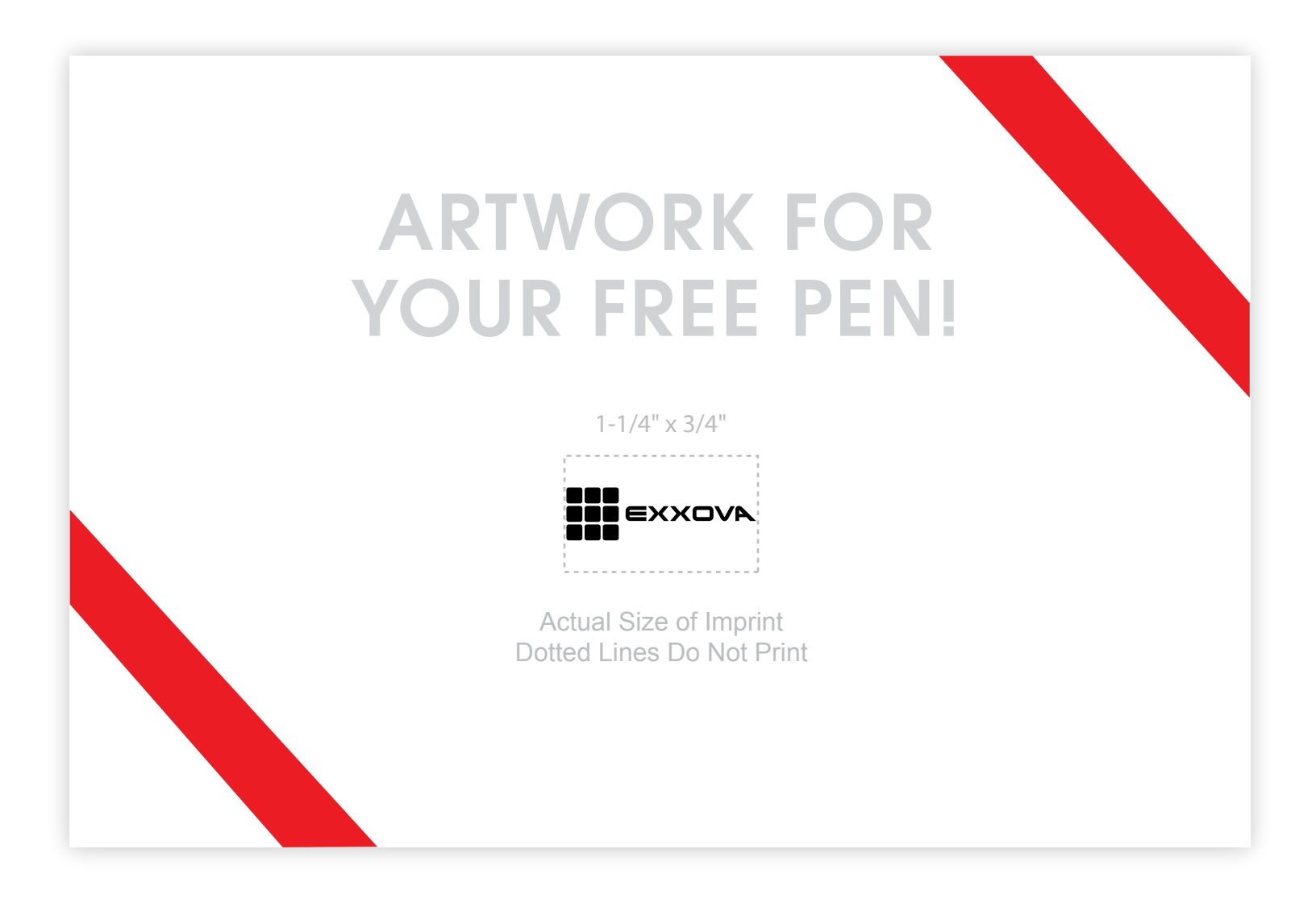
IMAGE IS FOR REFERENCE ONLY. COLORS, SIZE, AND APPEARANCE MAY DIFFER ON ACTUAL PRODUCT.

250 Pens with your logo FREE with any order $500 or more (BEFORE SHIPPING). Black imprint only. Our art dept will place your logo and/or one line of text to best fit the imprint area. Pens and pen color will be picked at random. Includes standard production and ground shipping within the continental US only. Other restrictions may apply. Limited time only.