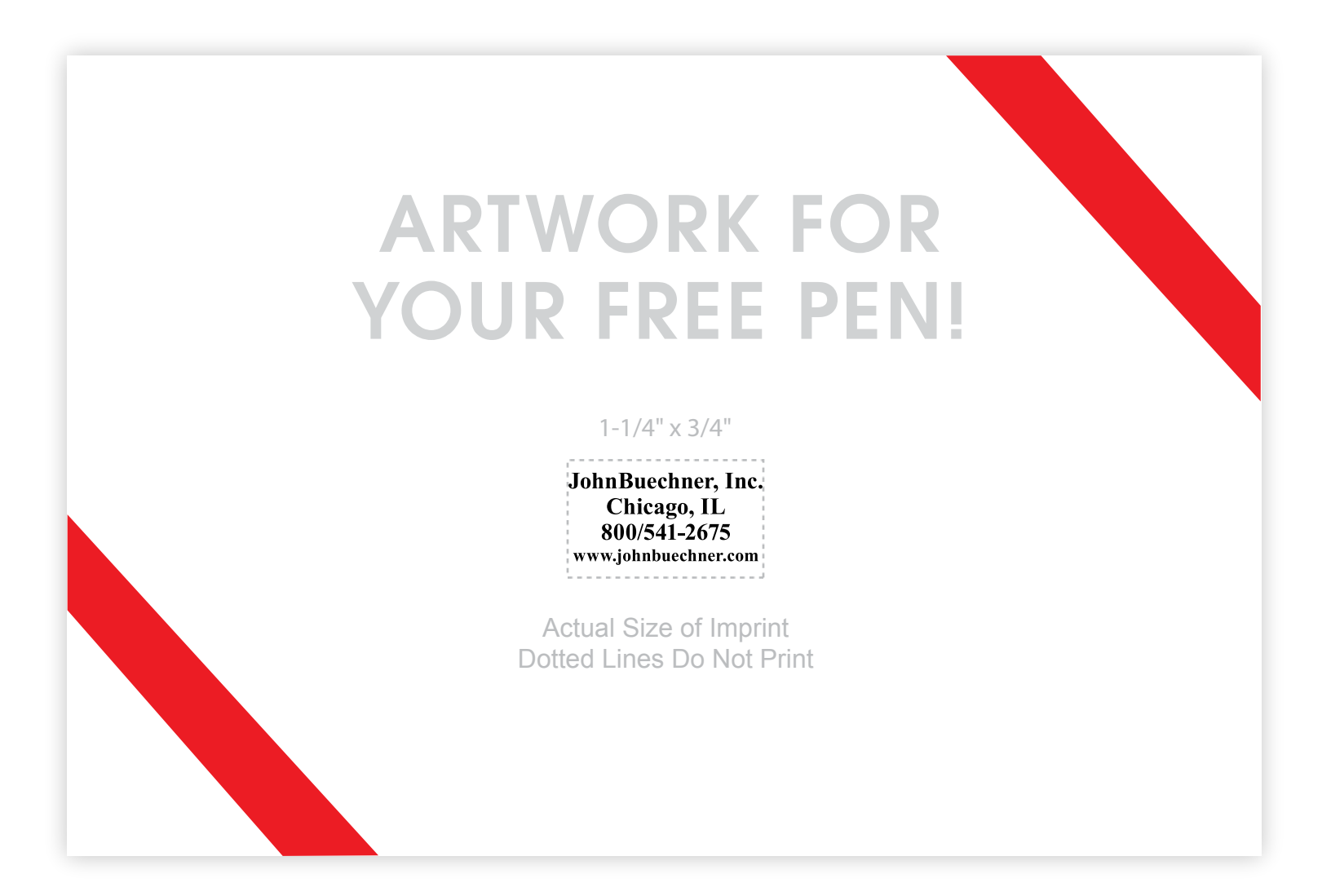
IMAGE IS FOR REFERENCE ONLY. COLORS, SIZE, AND APPEARANCE MAY DIFFER ON ACTUAL PRODUCT.

250 Pens with your logo FREE with any order $500 or more (BEFORE SHIPPING). Black imprint only. Our art dept will place your logo and/or one line of text to best fit the imprint area. Pens and pen color will be picked at random. Includes standard production and ground shipping within the continental US only. Other restrictions may apply. Limited time only.