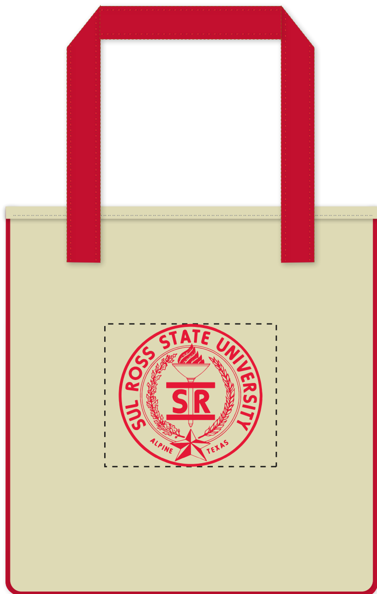
Image Not To Size For Reference Only Dotted Lines Do Not Print

PLEASE SEE PAGE 2 FOR YOUR FREE PEN PROOF.