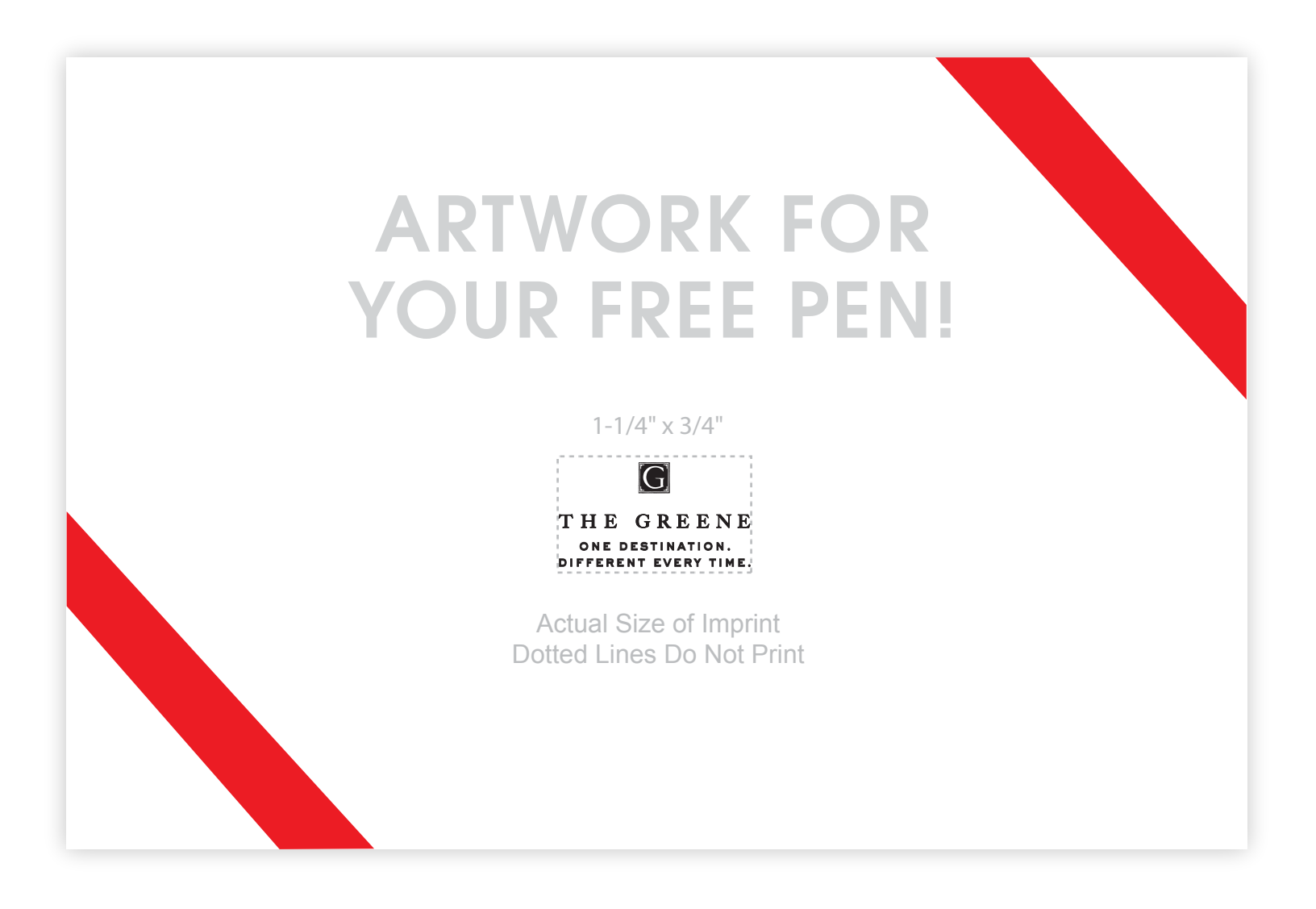
IMAGE IS FOR REFERENCE ONLY. COLORS, SIZE, AND APPEARANCE MAY DIFFER ON ACTUAL PRODUCT.

250 Pens with your logo FREE with any order $500 or more (BEFORE SHIPPING). Black imprint only. Our art dept will place your logo and/or one line of text to best fit the imprint area. Pens and pen color will be picked at random. Includes standard production and ground shipping within the continental US only. Other restrictions may apply. Limited time only.