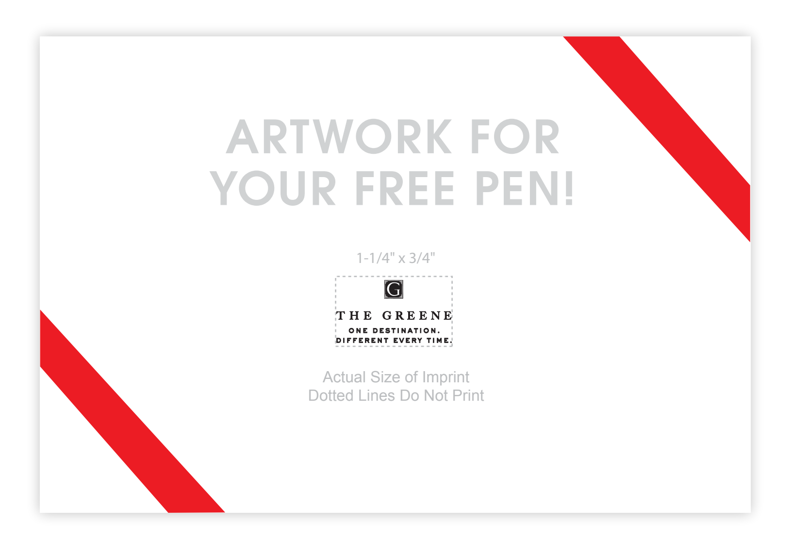
IMAGE IS FOR REFERENCE ONLY. COLORS, SIZE, AND APPEARANCE MAY DIFFER ON ACTUAL PRODUCT.

250 Pens with your logo FREE with any order $500 or more (BEFORE SHIPPING). Black imprint only. Our art dept will place your logo and/or one line of text to best fit the imprint area. Pens and pen color will be picked at random. Includes standard production and ground shipping within the continental US only. Other restrictions may apply. Limited time only.