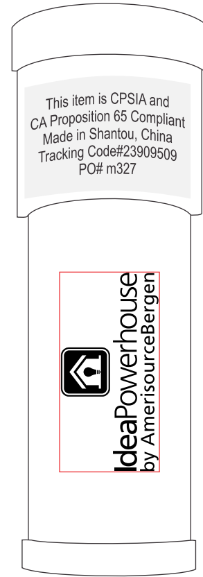
OPTION 3 (SUGGESTED)