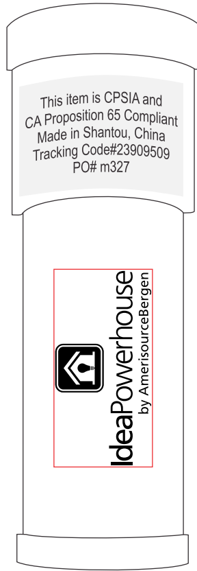
OPTION 2 (SUGGESTED)