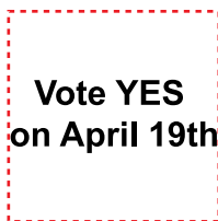
1" x 1" Bottom

Actual Size of Imprint Dotted Lines Do Not Print