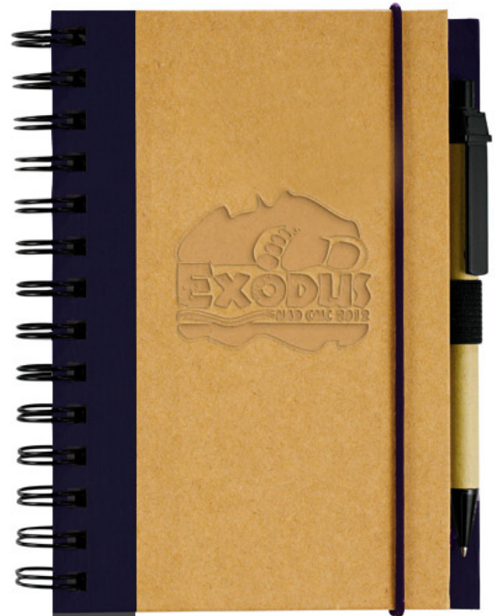
Image Not To Size For Reference Only May appear different on actual product.