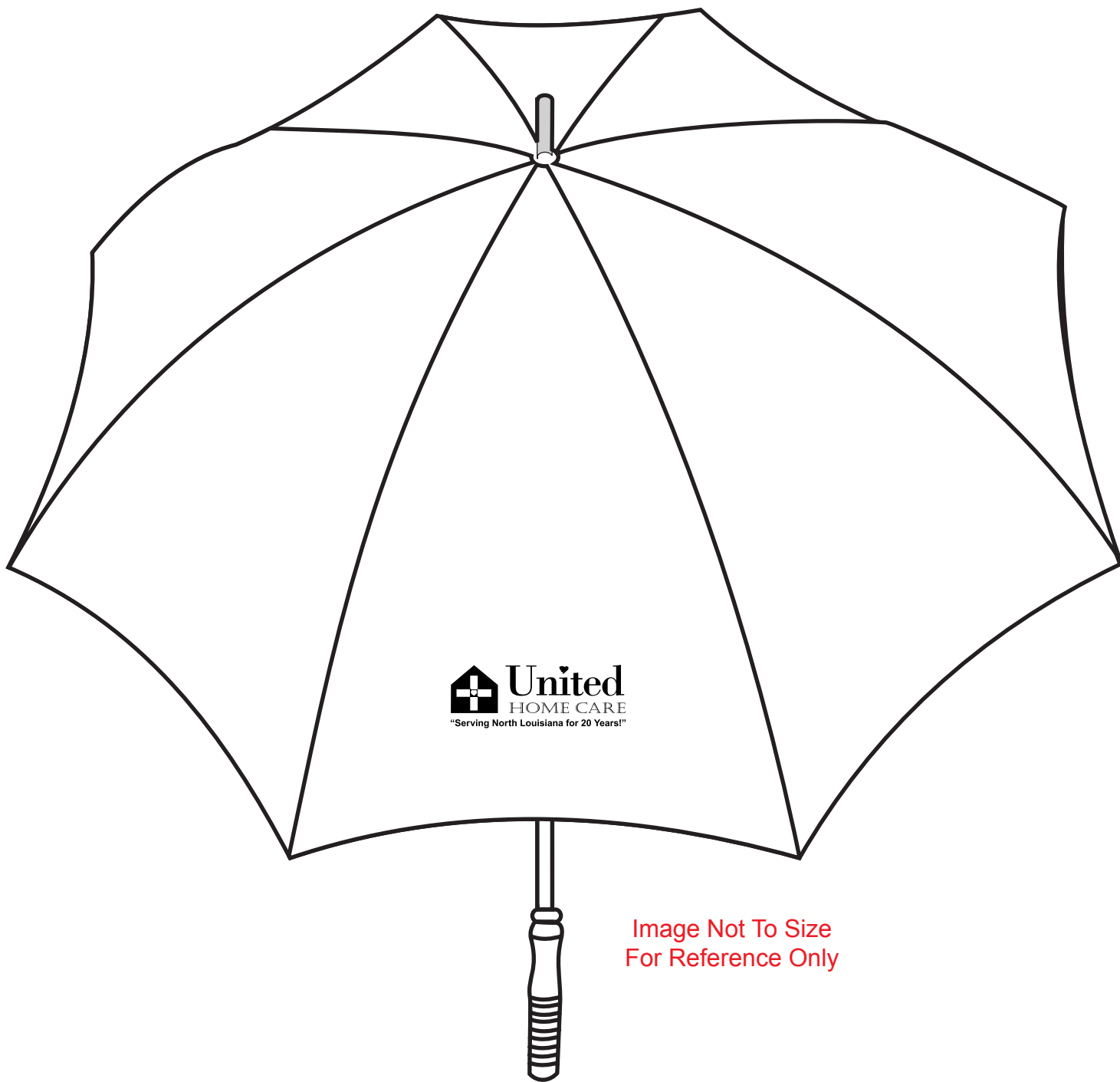
Image Not To Size For Reference Only

Imprint Method: Screen Print on the One Panel - White