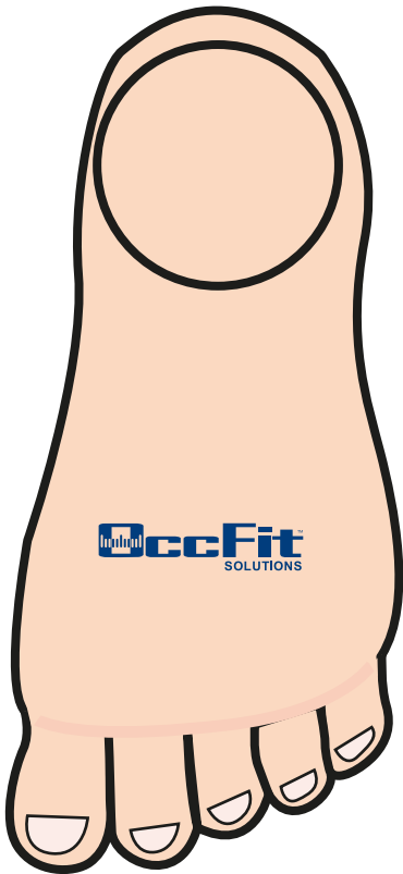
OPTION 2 (SUGGESTED)