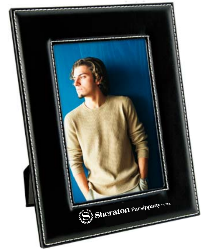
Enlarged for Clarity Image Not To Size For Reference Only