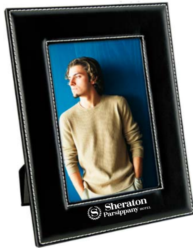
Enlarged for Clarity Image Not To Size For Reference Only