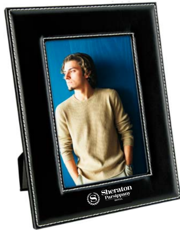
Enlarged for Clarity Image Not To Size For Reference Only