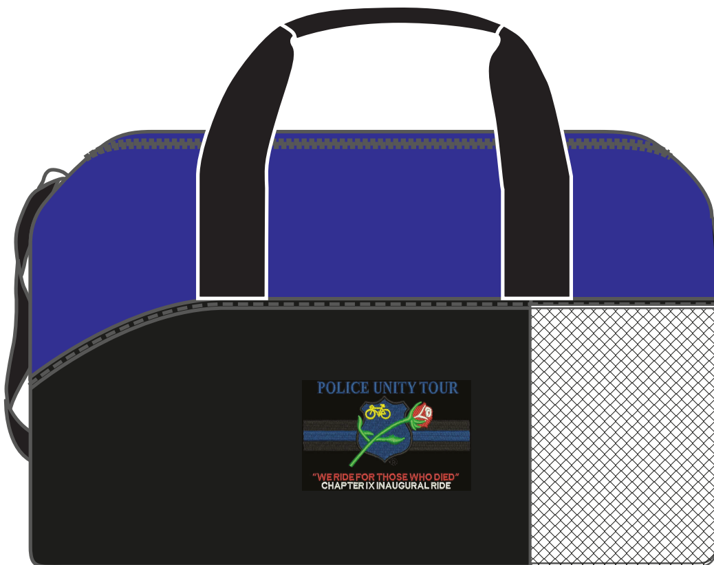
30% to scale