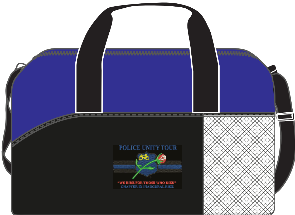
30% to scale

TEXT IS ENLARGED TO THE MAX EMBROIDERY AREA.