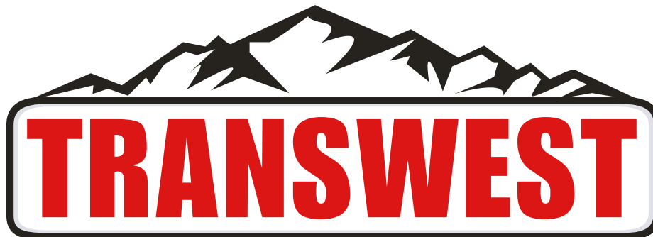
Actual Size of Imprint