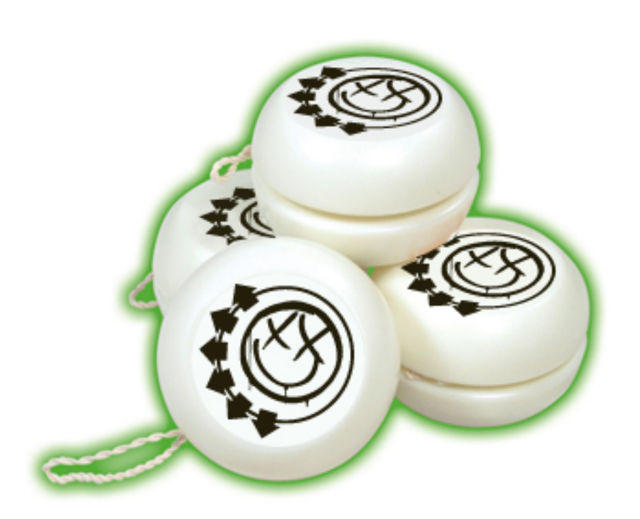
For Reference Only