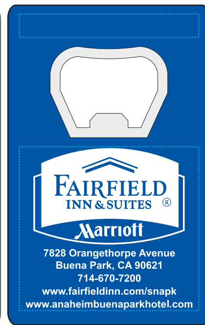
Blue color is only for reference: Not exact to product