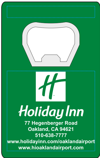
Green color is only for reference: Not exact to product

Actual Size of Imprint Dotted Lines Do Not Print