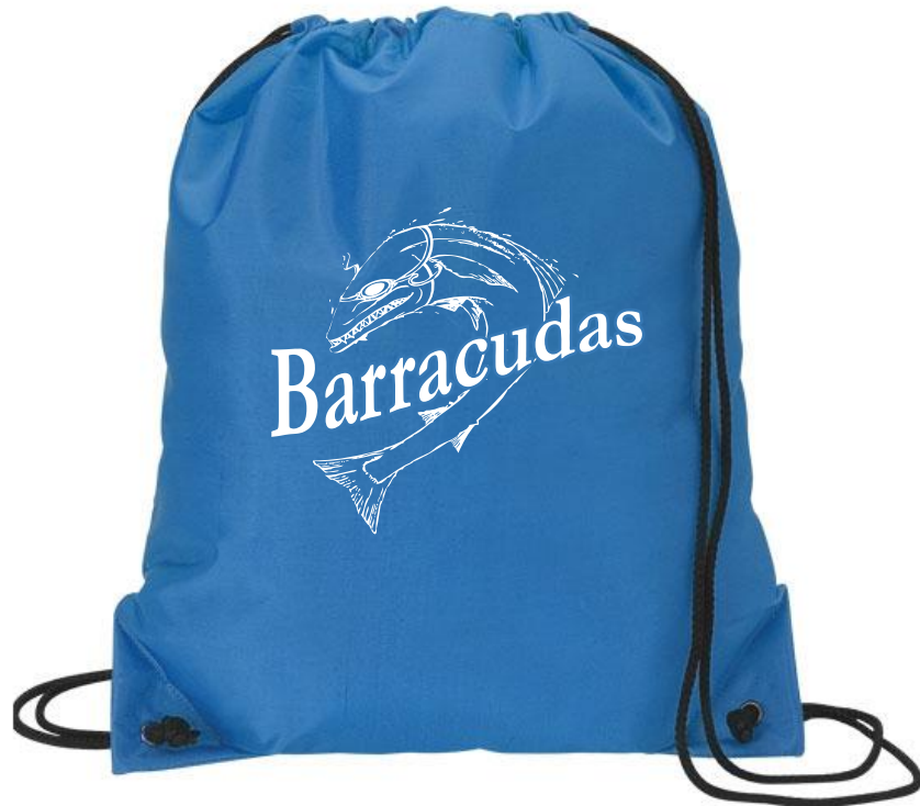
Image below is ONLY for Reference Colors and Size not exact, for logo placement reference.

When imprinted at 100% size is: 6.9094"W x 6.0905"H