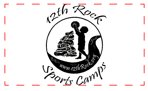
**Please note: The text within the rocks will fill in.