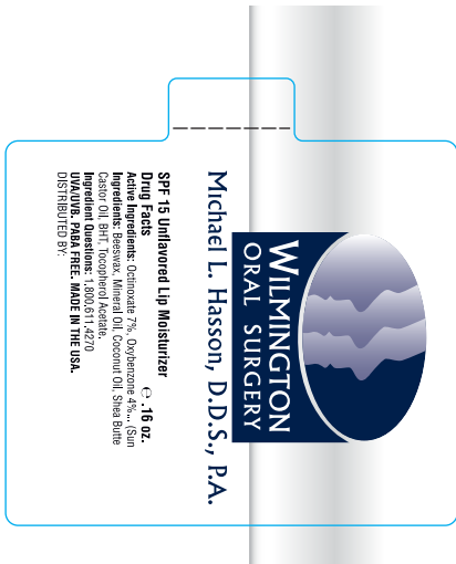
Enlarged for Clarity