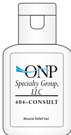
ACTUAL SIZE OF IMPRINT

****Smaller text would not fit into small imprint area, it was removed.