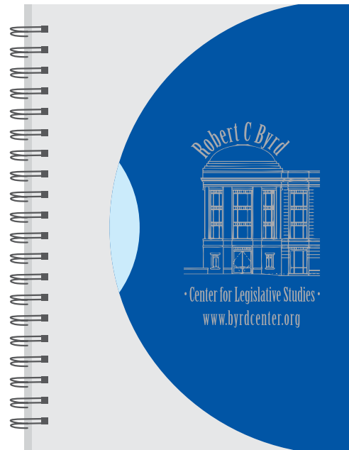
OPTION 2 Actual Imprint Size