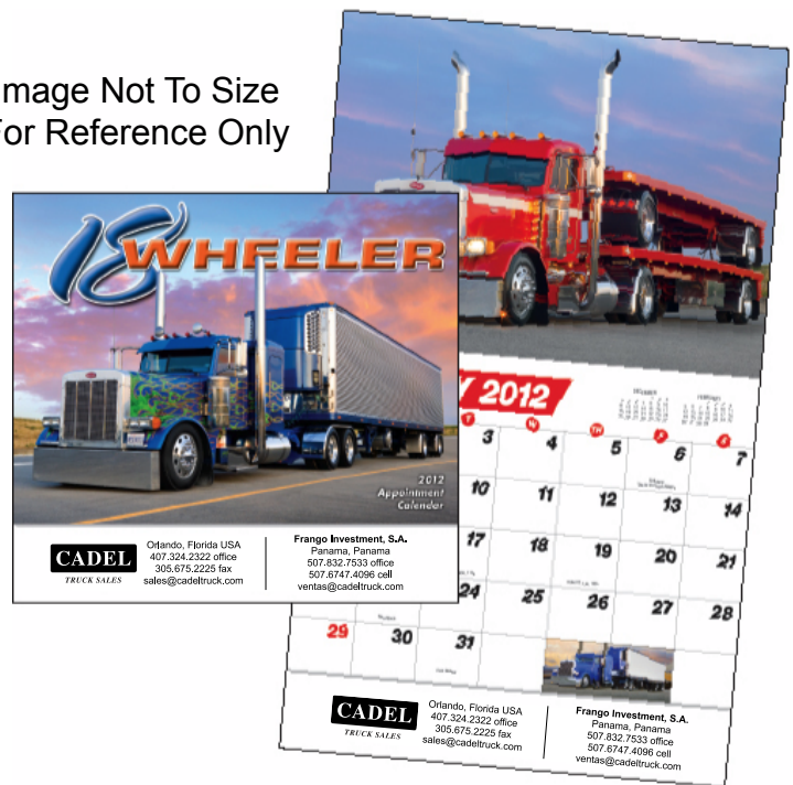
Image Not To Size For Reference Only

Order#: 115899 Product: 18 Wheeler Calendar Item #: 1295-105023 Imprint Method: Off-set Black