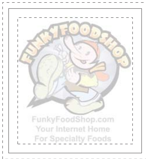
Actual Size T63053CMYK Imprint