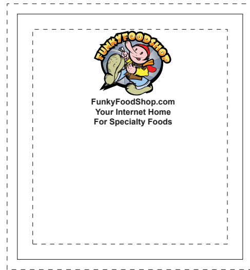
Option B: Art resized to minimum print size

Minimum Point Size: 6 pt. Minimum Line Weight: .5 CMYK Color