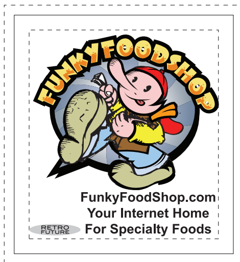
Actual Size T63053 CMYK Imprint

Please advise if a ghost imprint is wanted.