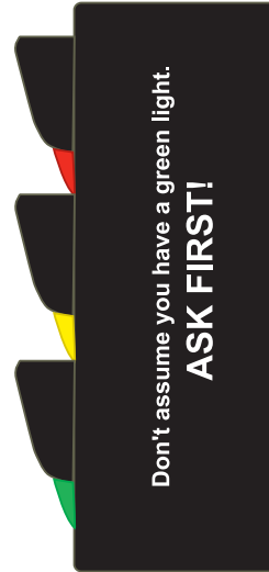
Traffic Light -black Side #2