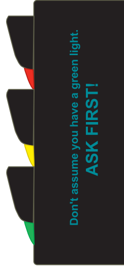
Traffic Light -black Side #2