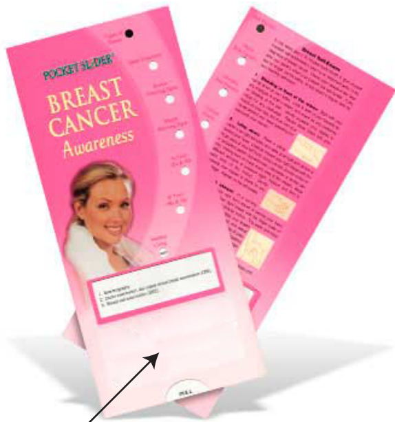
Imprint Location (Image For Reference Only)

Order#: 113106 Product: Pocket Slider Breast Cancer Awareness Item #: 1010-107992