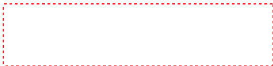
Helping Hand Back Scratcher W/ Shoe Horn