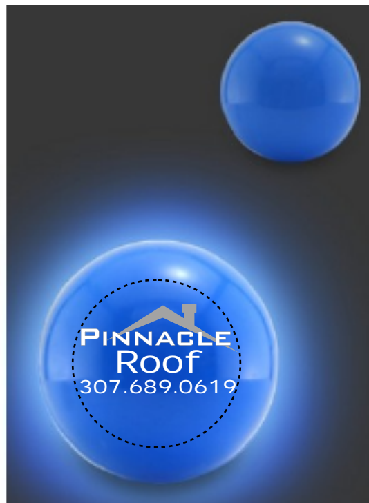
Actual Size of Imprint Dotted Lines Do Not Print