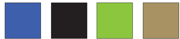
TOTE BAG COLORS