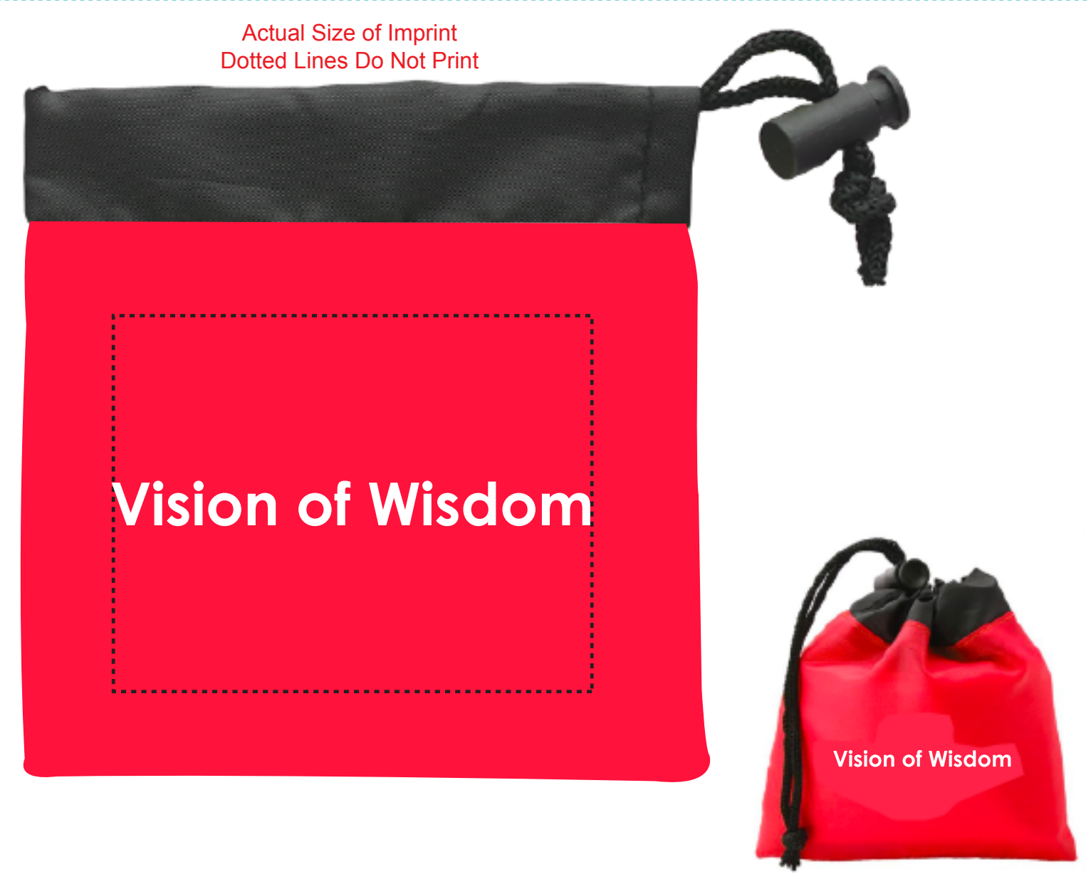
Graphic is for placement only Not to scale