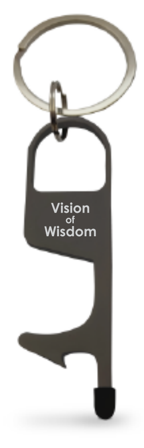
Graphic is for placement only Not to scale