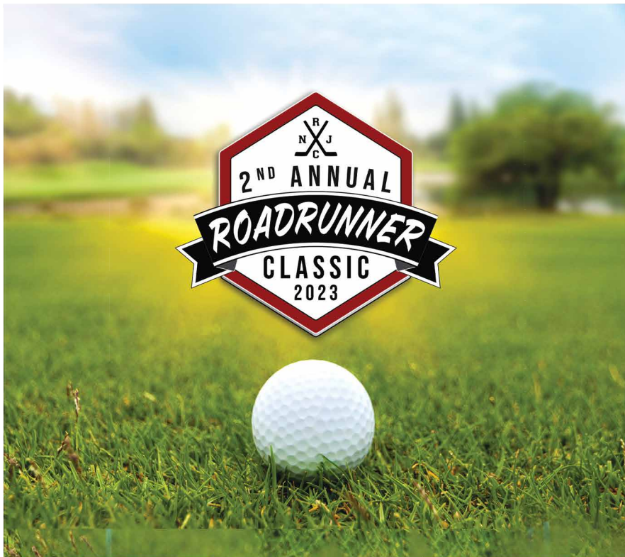
SIDE 1 OF KOOZIE