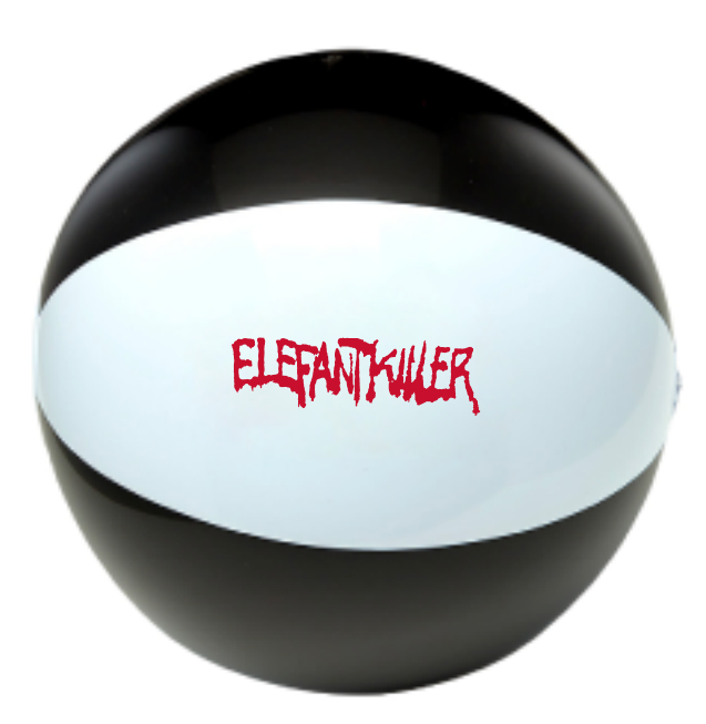
Graphic is for placement only Not to scale