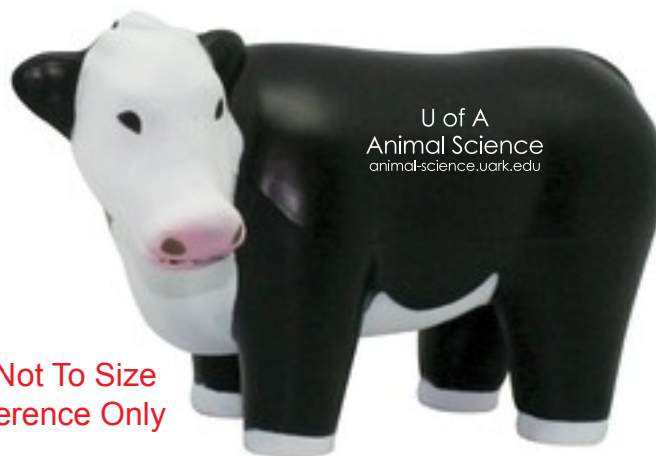
Image Not To Size For Reference Only