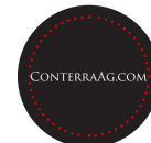
Black Ballmarker with White Imprint