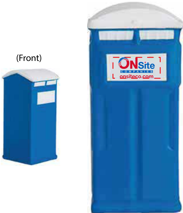
Location 1 (Back)