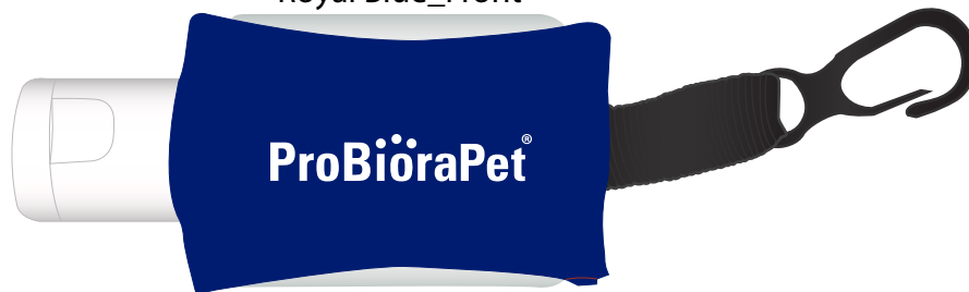
Cozy Clip Hand Sanitizer - Half Ounce Royal Blue_Front

“®” will print as a dot at such a small size. I recommend removing, or leaving as is. Please advise.