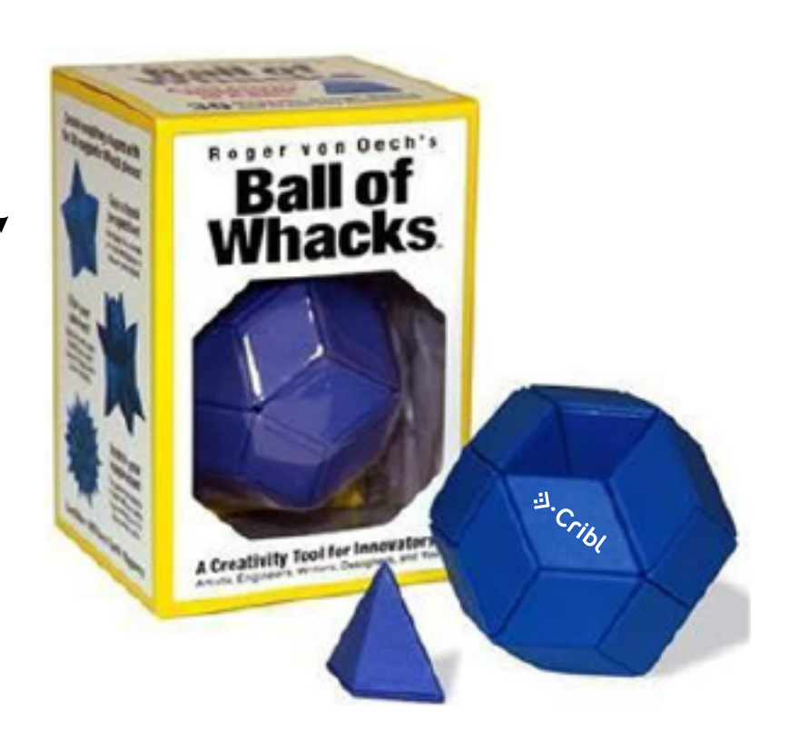
Graphic is for placement only not to scale