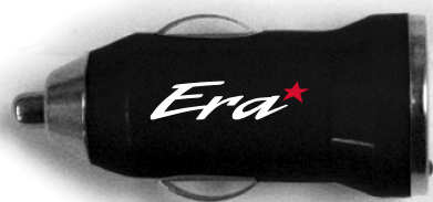
Actual Size of Imprint

Product: Helicopter Stress Ball: White Item #: 008-100734