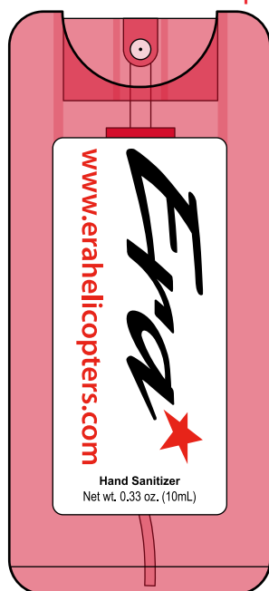
Actual Size of Imprint

Imprint Method: 4 Color Process on the Front on Label Actual Imprint Size: 0.7278 in x 1.8125 in