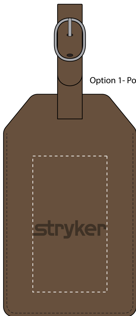
Option 1- Portrait Layout

Actual Imprint Size: 1.5"W x 0.37"H (Portrait), 2.7"W x 0.67" H (Landscape)