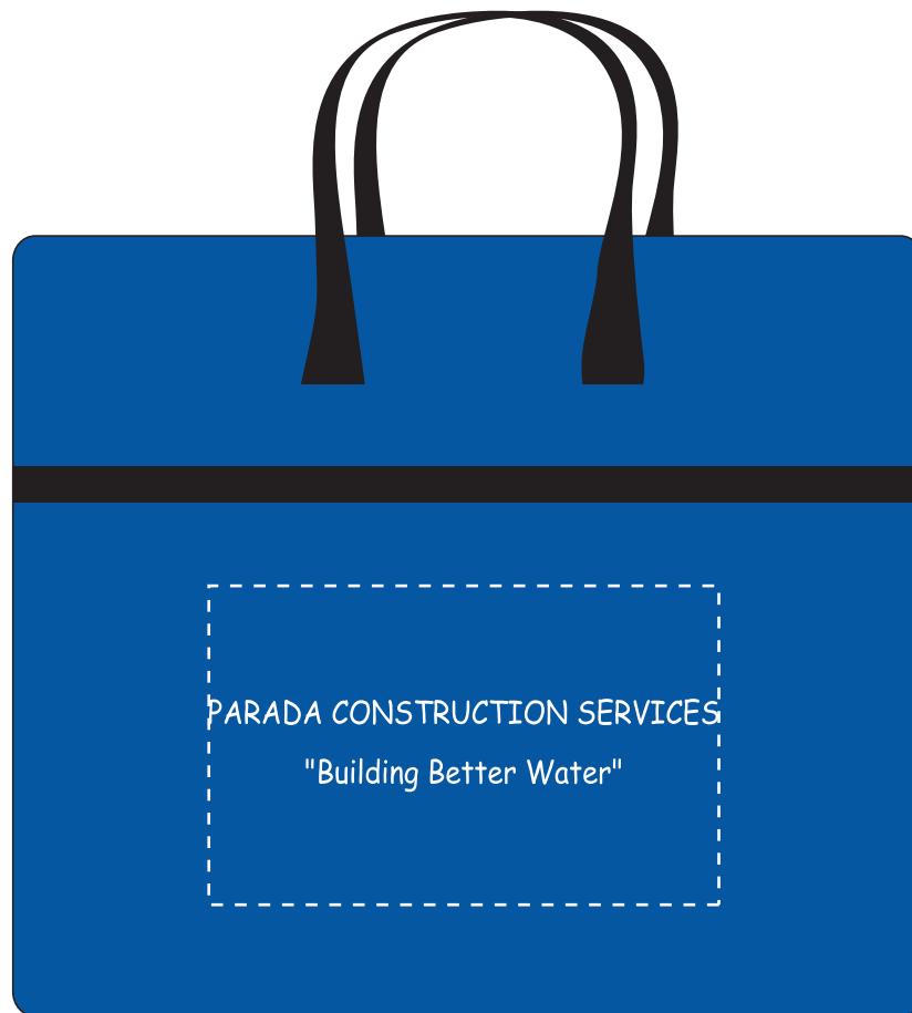
Item Rendering shown at 30% of actual size