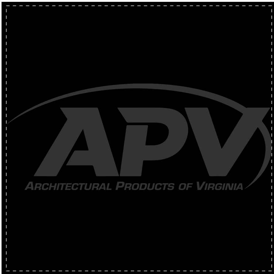
Actual Size of Imprint Dotted Lines Do Not Print