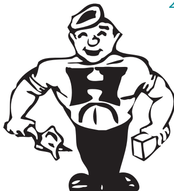
200% of actual size

School City of Hobart Building College and Career Ready Brickies!