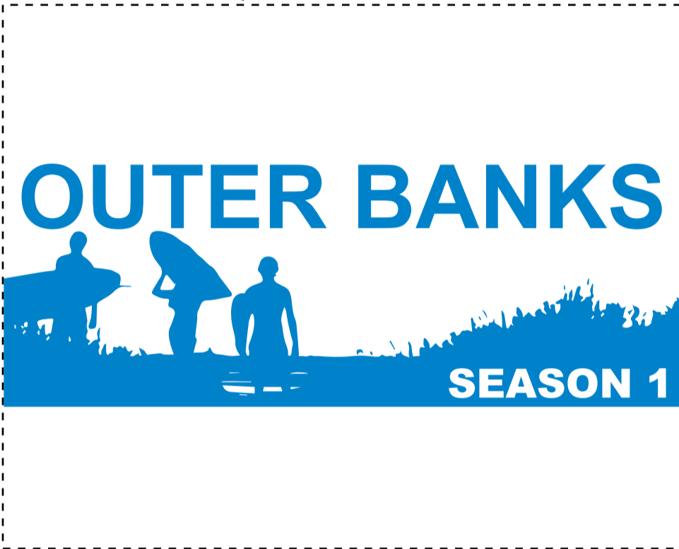
Option 1- Screen Print

Please note: the screen print imprint method (Option 1) allows for a much larger logo than the embroidery option. Please advise which option you'd like to proceed with.